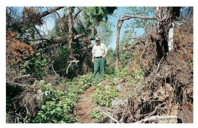
FIRES Aug 2 th 2019 - pm