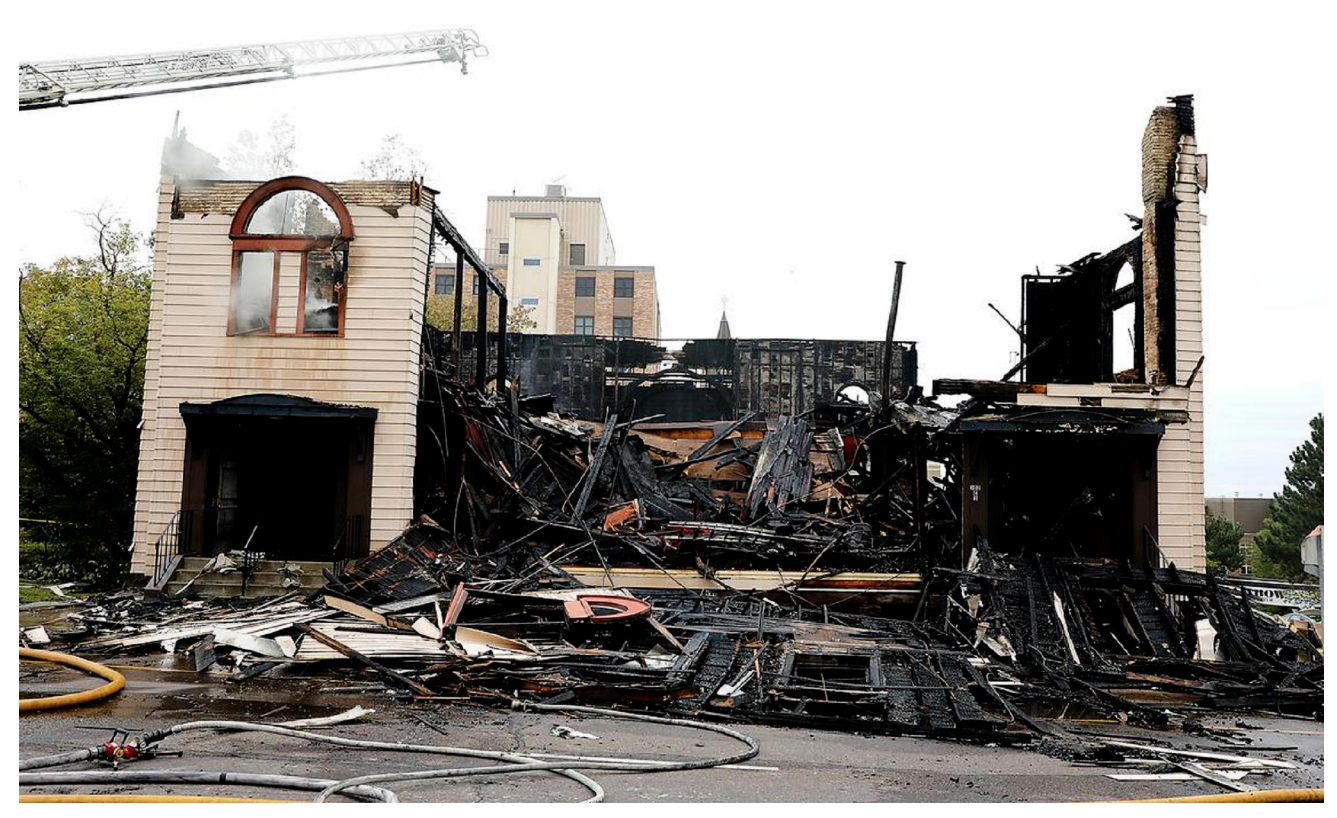
Smoke still rolls out of a window after fire destroyed the Adas Israel Congregation synagogue Monday in Duluth.